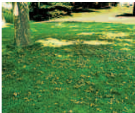
leaves on the ground in midsummer is a symptom of anthracnose and will leave a thin or weak appearing canopy