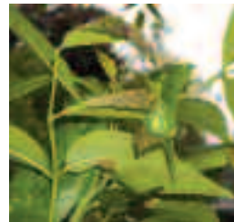
leaf symptoms on ash in midsummer