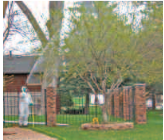
treatment of anthracnose is done by spraying the leaves in the spring